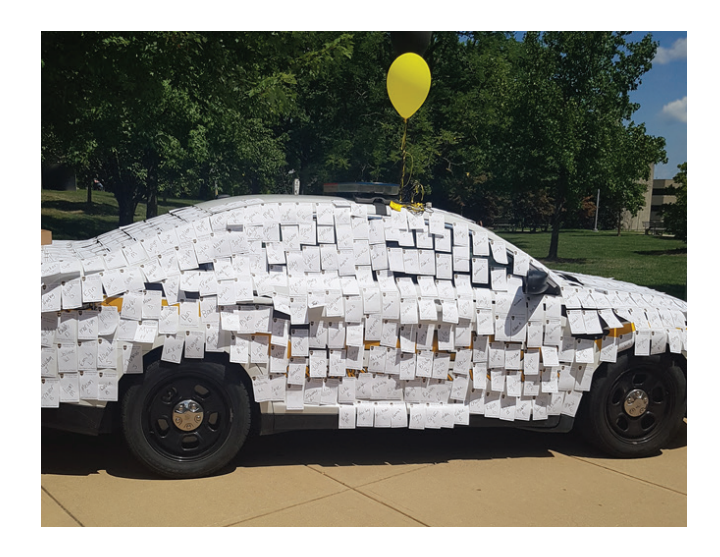
UPD Pledge Event – Reminding students the UPD officers pledge to treat them with dignity and respect.

All university employees, faculty members, their dependents and household members are eligible to use the services provided by NKU's Employee Assistance Program (nku.edu/hcsw/eap).