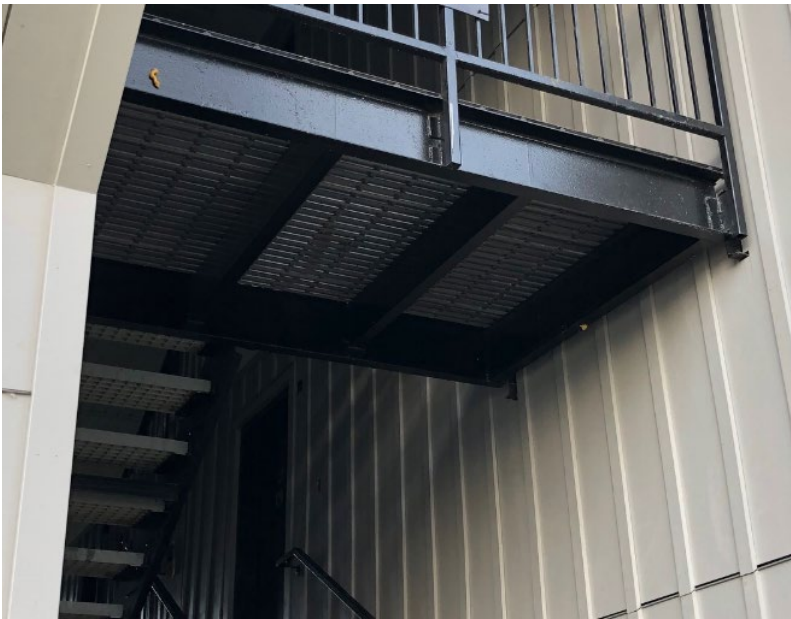
Siding Installation in Process, Norse Hall Breezeways, November 30, 2021