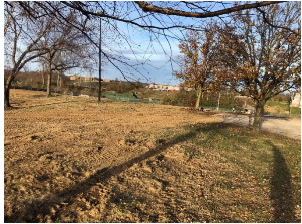
Woodcrest Site, Cleared and Ready for Seed, November 2021