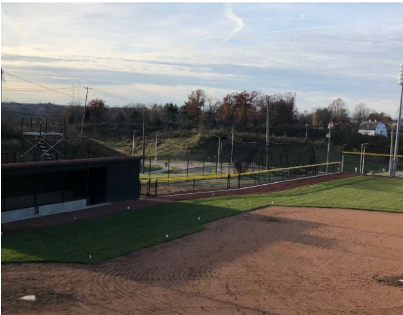
Completed Softball Field, November 2021