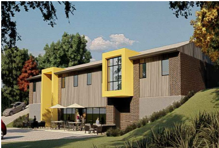
Rendering of Opportunity House, Facing Campus (Looking West)