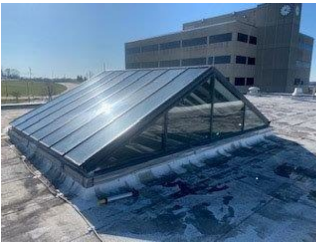
One of two existing skylights that will be replaced.